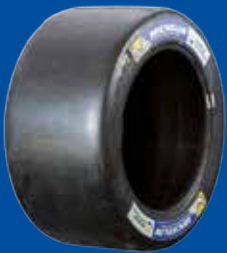
HYBRID (SLICK INTERMEDIATE)