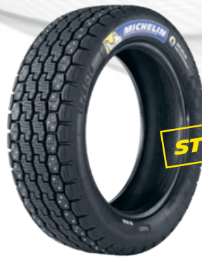
PILOT ALPIN NA01