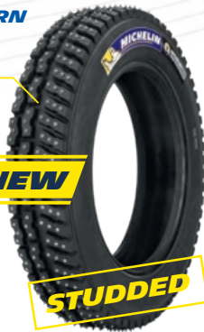
PILOT ALPIN NA01