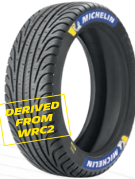
PILOT SPORT FW3