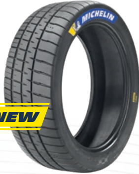
PILOT SPORT A.MW1